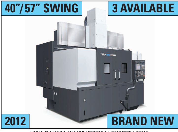
HYUNDAI WIA LV1400 VERTICAL TURRET LATHE