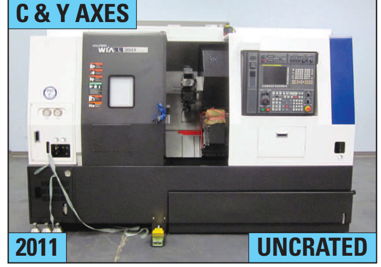
HYUNDAI WIA L200Y CNC TURNING MACHINE

HYUNDAI WIA KH1000 HORIZONTAL MACHINING CENTER